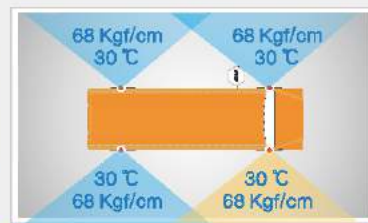
Tire pressure monitoring system